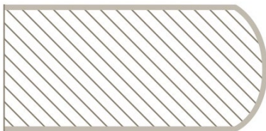
Ideal Double Radius 1 ½"