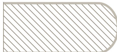
Ideal Bullnose 1 ½"

Special Order: All standard color/finish combination available except no sculpted finish, Chemtop2, Colorcore2 or solid colors. Made to order allow approximately 7-10 business days for us to receive from factory. There is a 2 stick minimum/multiples of 2.