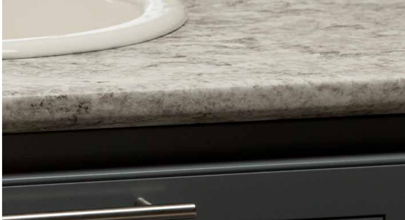
Edge: Tiburon Laminate: Italian White di Pesco Wilsonart® 4954-22

One source. Many beautiful looks. Only from VT.